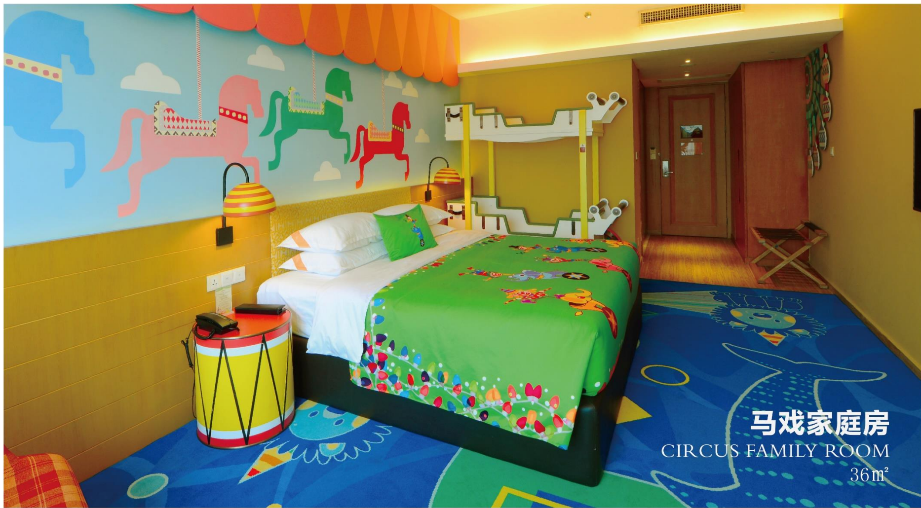
马戏家庭房 CIRCUS FAMILY ROOM 36m 2